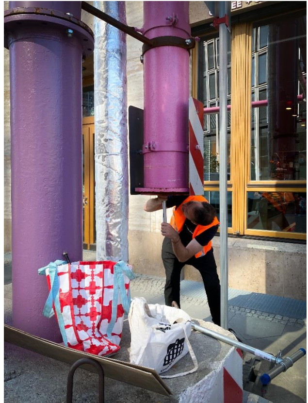
Nik Nowak: Rabbit Hole, 2021, Sound Installation,