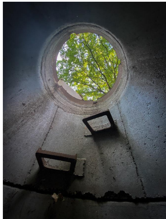
Ed Davenport: Under Construction, 2021 Sound Installation in two parts, Volkspark Humboldthain near swimming pool